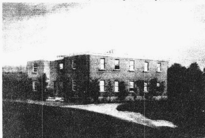
The Old Hall, formerly the Rectory, on the site of Elm Farm.

6.30 p.m. in the church Proceeds for church funds